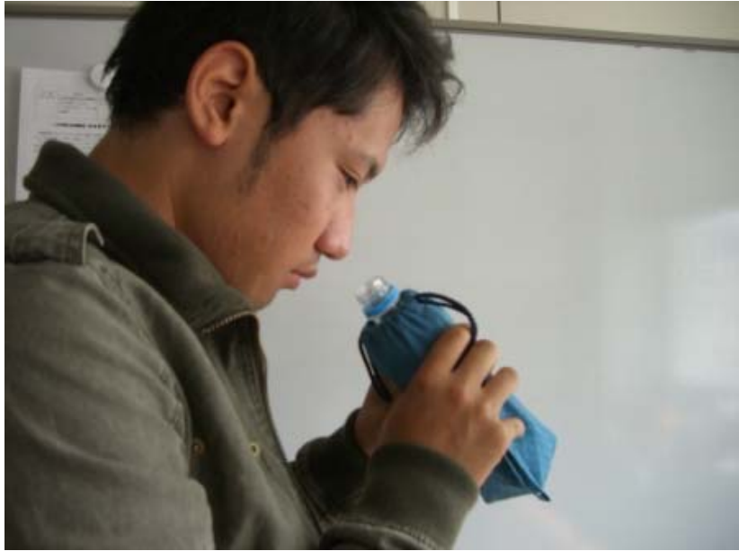
Photo 1 How to smell odor

The sample water collected from the irrigation pond is diluted with soft drinking water 1/2, 1/4, 1/8 and so on. The sample water is put into PET bottles. To prevent the panel from judging from the sample's color etc, a covered sample, as well as a blank sample is given to the panel as shown in Photo.1. Next, the panel would open the lid of the PET bottle and compress it before smelling the odor filled inside and choosing the bottle with odor. When the odor becomes thin to an undeterminable level, it is considered as inaccurate. When samples of the same concentration become inaccurate twice, the experiment ends.