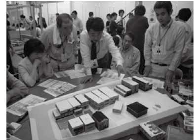
Fig7. Embodying Workshop

And for now, re-building project and designing project are in progress. And the professionals made group to support the revitalization and also making contact with each level governments and embodying the vision. But in this period, information sharing is extremely important that local professional supports ordinary decision making and other professionals join only the turning point. So in this period information sharing media needs to be developed.