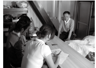
Fig3. Interview to the victims

After the interview project, we showed revitalization process of Kobe, by invited one professor who did the revitalization support and review at Kobe to know and share the process and time. But by reviewing the process, I knew that it was too early for victims by the word “I thought that it was wasting time to attend the presentation at that time” by one victims.