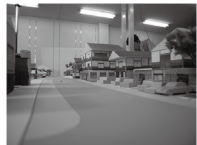
Fig8. Revitalization Simulation