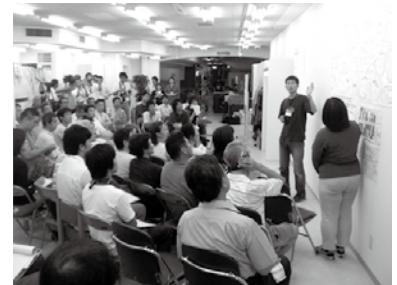
Fig4. Result Presentation