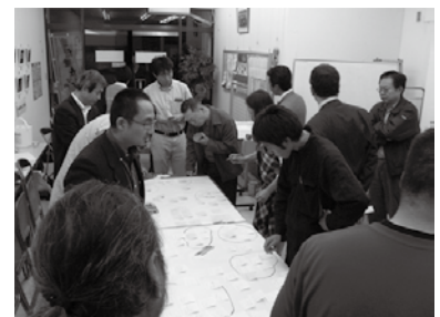
Fig5. Vision Planning Workshop

After the first step the victims start to think about the town revitalization but there was no goal, which can share. So local professional –who is myself- started to make revitalization vision that can share. In this process, meeting has held on every Wednesday night for 3 months. And in case, another meeting was set on other day and did town walking. Finally, at the end of 2007, revitalization vision was completed and announced. This vision was mainly written by word not drawing. It is because to share the vision not the plan. It made one shared goal for this street.